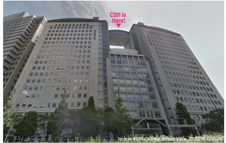
Buildings of Bunka Gakuen University

Pre-registration opens at 15:00 and welcome reception starts from 17:00 at C201, 20th floor of the building C.